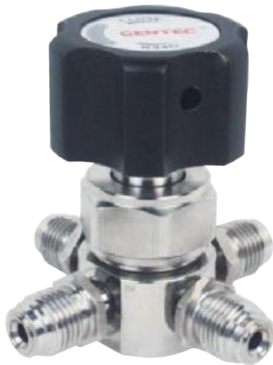
Manual (High Pressure)