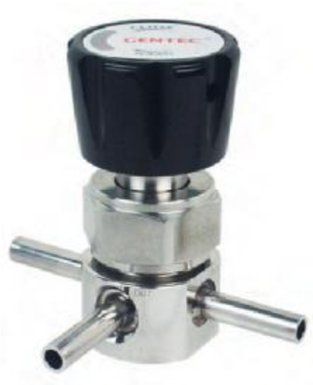
Manual (Low Pressure)